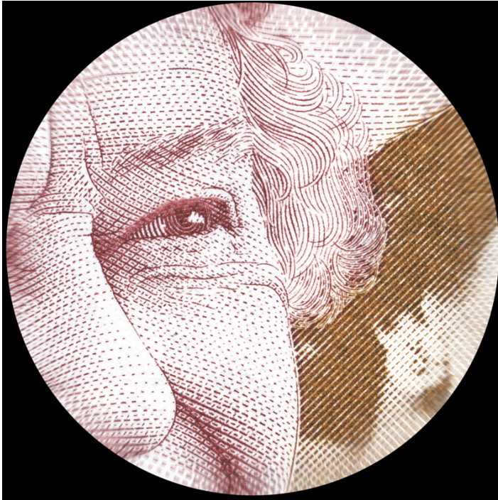
A magnification of the fragment of the examined object