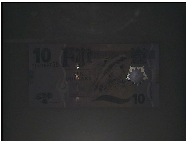
White coaxial light