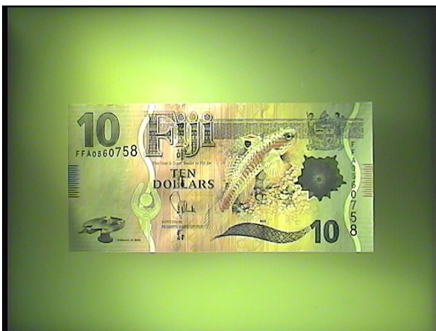
White oblique light