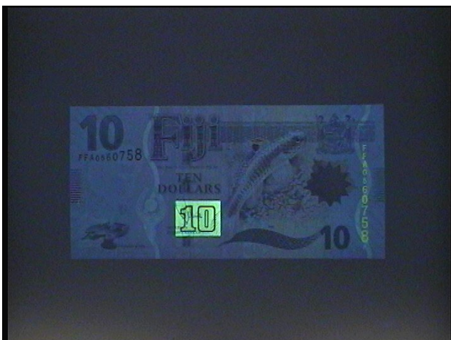
Ultraviolet top light (365 nm)