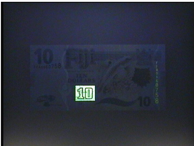
Ultraviolet top light (313 nm)