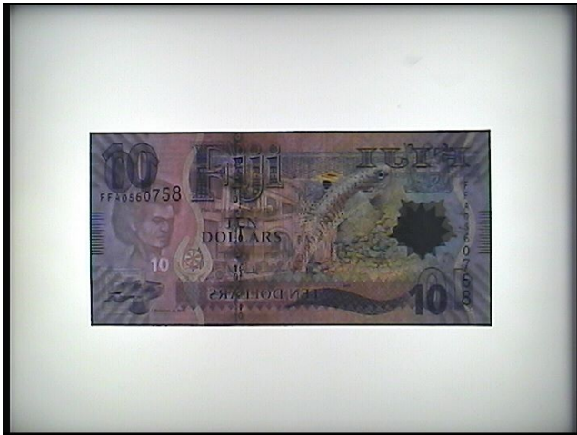
White transmitted light