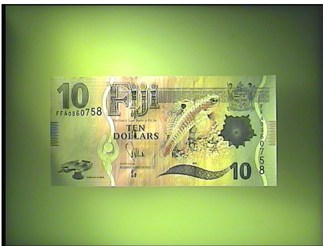
White oblique light