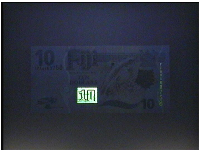
Ultraviolet top light (313 nm)