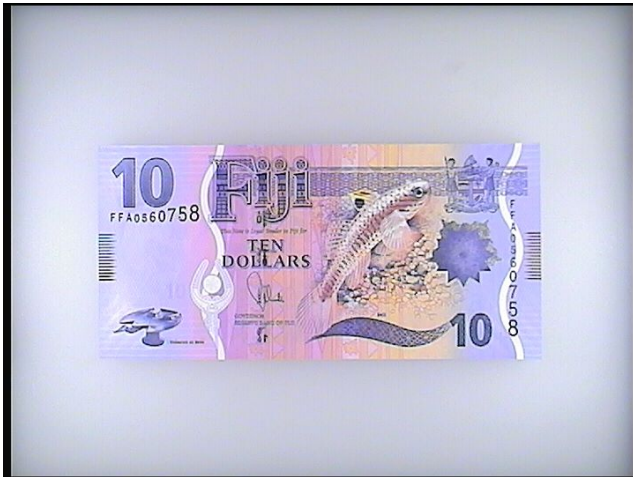
White top light