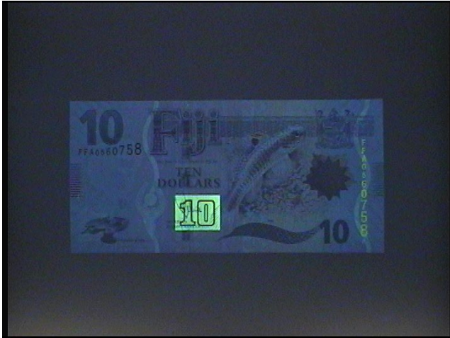
Ultraviolet top light (365 nm)