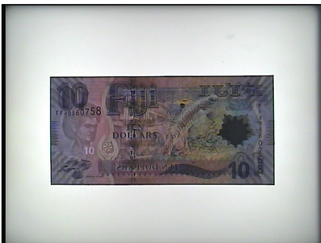
White transmitted light